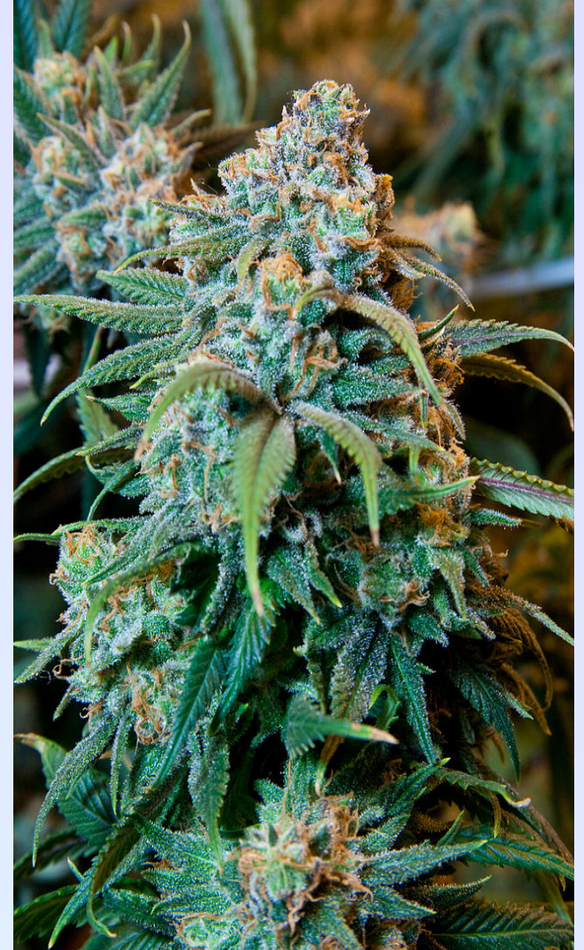
Cannabis plant